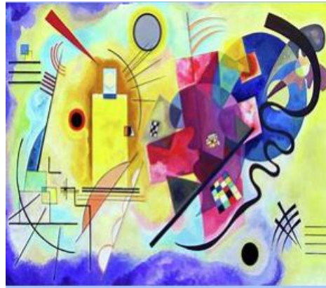
"Colour is a power which directly influences the soul."

You will find out about Kandinsky and reflect on his work using key vocabulary.