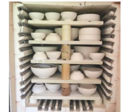
Kiln will heat clay to 1000c