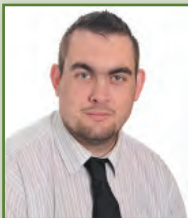
Year 7 update

In addition I would like to thank all the parents that attended the recent parent evenings, Year 7 parents alone attended over 1200 appointments over the three evenings. Your continued support in your child's educational journey is very much appreciated. If you have any further concerns or questions please do not hesitate to contact your child's form or subject teacher.