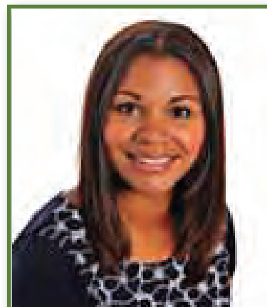
Year 8 update

As soon Year 8 began, the pupils had to begin the process of considering their journey after St John's! I know they enjoyed the assemblies presented by some local high schools and attending their open evenings to see what they have to offer. Fingers crossed you all get the place you wish for when they are released next term.